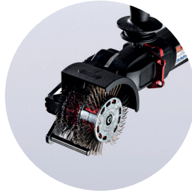
BRISTLE BLASTER® DOUBLE