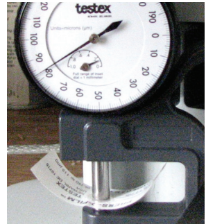
• 83 µm Rz (3.3 mil)