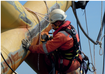
Bristle Blaster® on an offshore platform

Absolutely Gründlich stands for a thorough and sustainable long-term protection of your assets. MontiPower®-preparation from scratch!