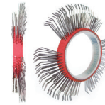
BRISTLE BLASTER® AXIAL BELT, STAINLESS STEEL, 11 MM, LEFT