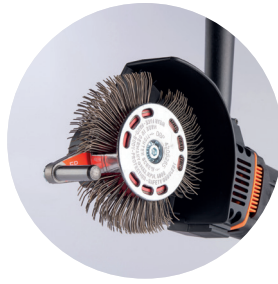
BRISTLE BLASTER® ELECTRIC