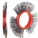
BRISTLE BLASTER® AXIAL BELT, STEEL, 11 MM, LEFT