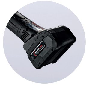
BRISTLE BLASTER® CORDLESS