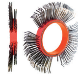
BRISTLE BLASTER® AXIAL BELT, STEEL, 11 MM, RIGHT