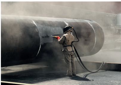
Conventional grit blasting