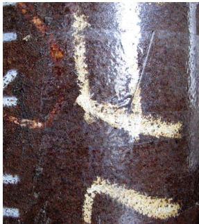
API 5L Piping