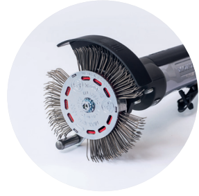
BRISTLE BLASTER® AXIAL