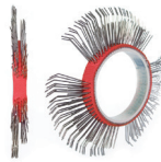
BRISTLE BLASTER® AXIAL BELT, STAINLESS STEEL, 11 MM, RIGHT